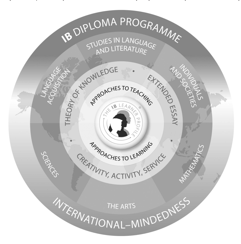
Figure 1 Diploma Programme model

The course is presented as six academic areas enclosing a central core (see figure 1). It encourages the concurrent study of a broad range of academic areas. Students study two modern languages (or a modern language and a classical language), a humanities or social science subject, an experimental science, mathematics and one of the creative arts. It is this comprehensive range of subjects that makes the Diploma Programme a demanding course of study designed to prepare students effectively for university entrance. In each of the academic areas students have flexibility in making their choices, which means they can choose subjects that particularly interest them and that they may wish to study further at university.